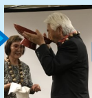
New tradition of JCAH? Past presidents passed around a large cup of sake, or Mawashinomi.