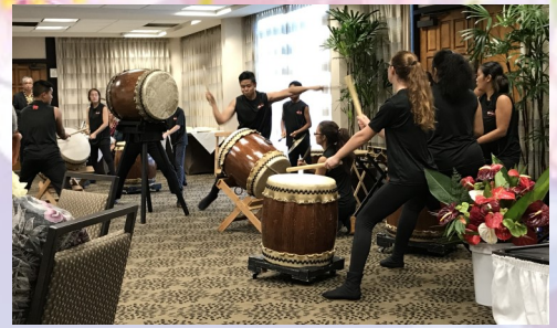
Stunning performance by Puna Taiko